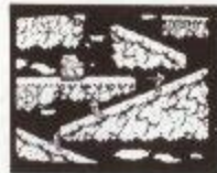
Massacre Mountains (Level 5)