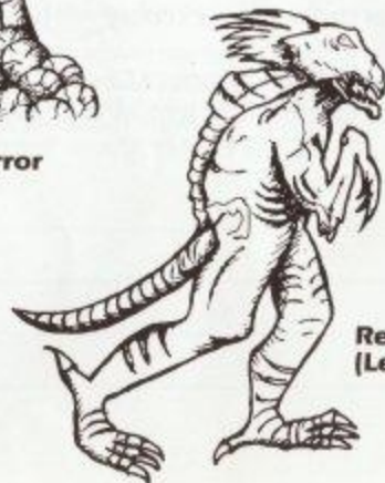
Red Falcon (Level 8)