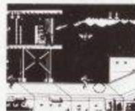
Gates of Fort Fire Storm (Level 1)