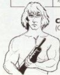
Corporal Lance (Code name: Scorpion)