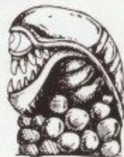
Jagger Froid's Spit Soldier (Level 8)