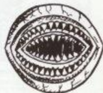
Lip-O-Suction (Level 6)