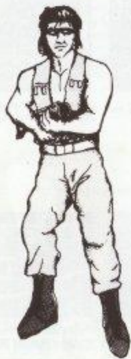
Alien in Sergeant Skin's Clothing (Level 1)