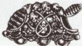
Krypto-Crustacean (Level 5)