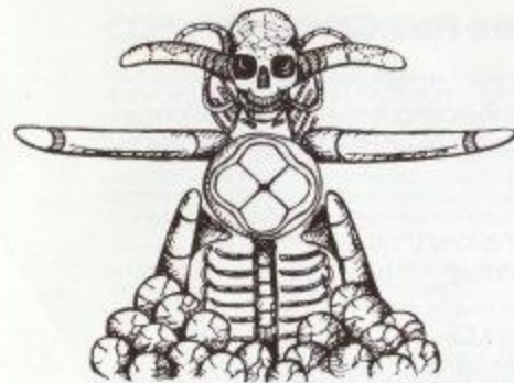
Temple of Terror (Level 7)